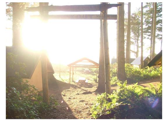
Inquiry Based Science Exploration Spaces