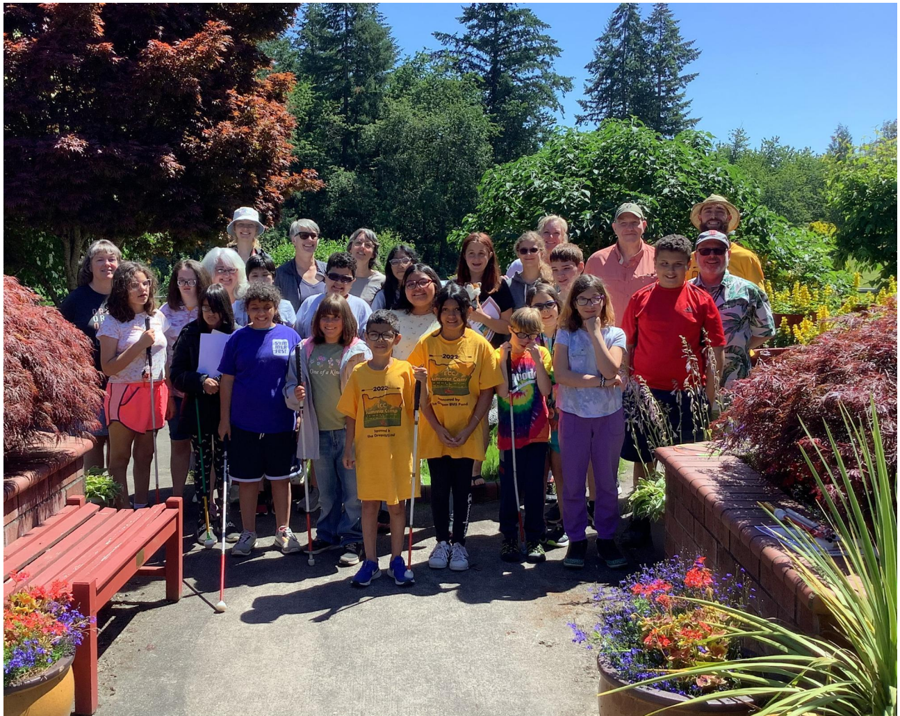
Eighteen students who experience visual impairments stand with their teachers and counselors in a garden with flowers and trees. The students were participating in a weeklong residential summer camp in July of 2022 at Oral Hull Park in Sandy, Oregon.